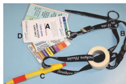
A: Front and back surfaces of identity badge. B: Two 9 cm lengths of the lower lanyard. C: Connections (eg, clips, keys, pens). D: Distal edge of badge. ♦